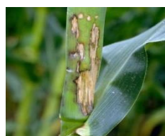
Bacterial stalk rot